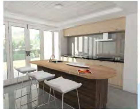
Residential Kitchen Cabinets