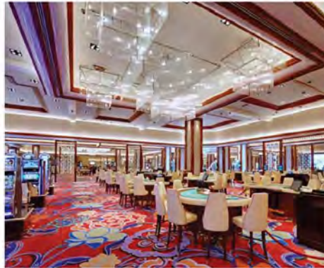
Solaire, Manila (GRG)