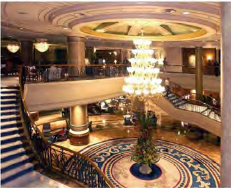
Peninsula Hotel, Manila (GRG)

Our Joinery division (Hannah Group Inc.) represents experience, technology and quality with the capability of producing kitchen cabinets, wardrobes, vanity units and decorative architectural products on a large scale using our computerized machinery including CNC routers.