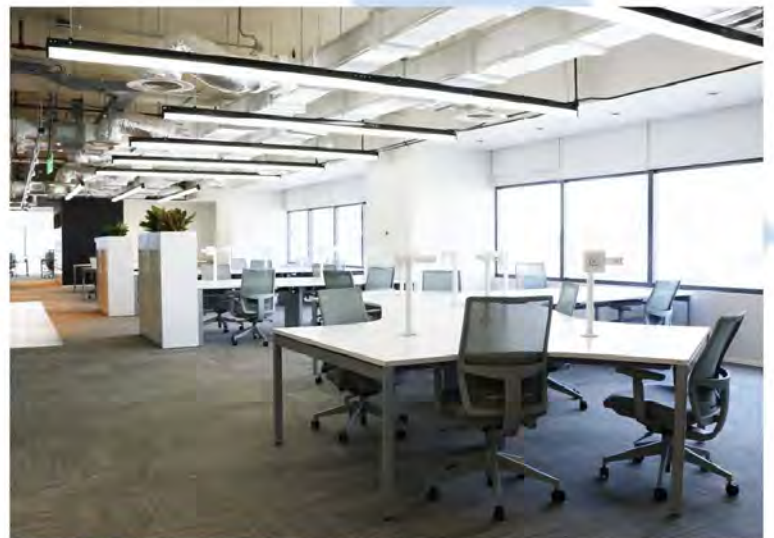
Novartis Office, Manila