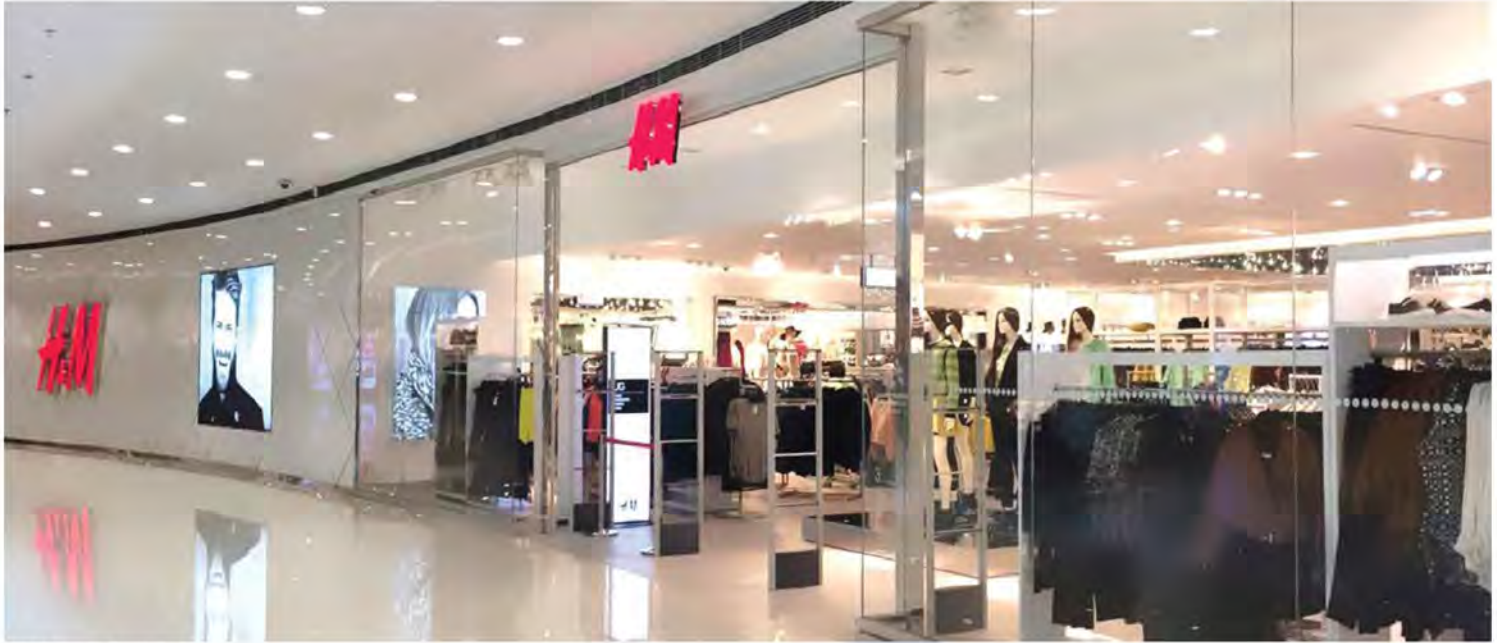
H&M Store, Festival Mall

Projexasia is a general contracting company specializing in interior fit-out design and build projects. Whether we are working on small, bespoke works, or a large-scale project, our focus is on setting the standard for interior services. Central to this is our commitment to consistency which help us to deliver predictable outcomes for our Clients, regardless of their building type, location or the sector in which we operate. We transform empty space into our Client's vision. Our teams have delivered bespoke interiors for some of the worlds most successful and well-known organizations in their respective fields. Working with their consultants, or interpreting their brief to deliver an interior project, our collaborative approach has resulted in the successful delivery of projects for our Clients.