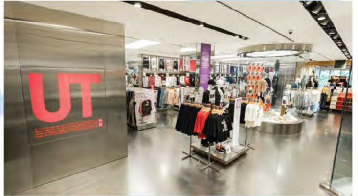
UNIQLO Flagship Store, Manila