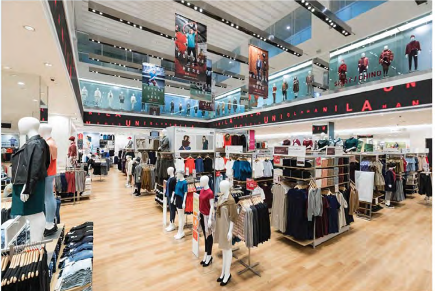
UNIQLO Flagship Store, Manila

To promote a culture of clear communication and team spirit within our organization and with our Clients and business partners.