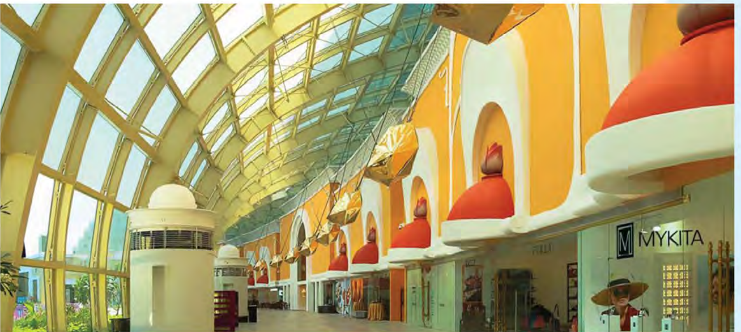
Okada, Manila (GRG/GRP)