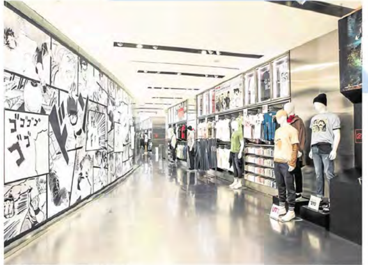
UNIQLO Flagship Store, Manila