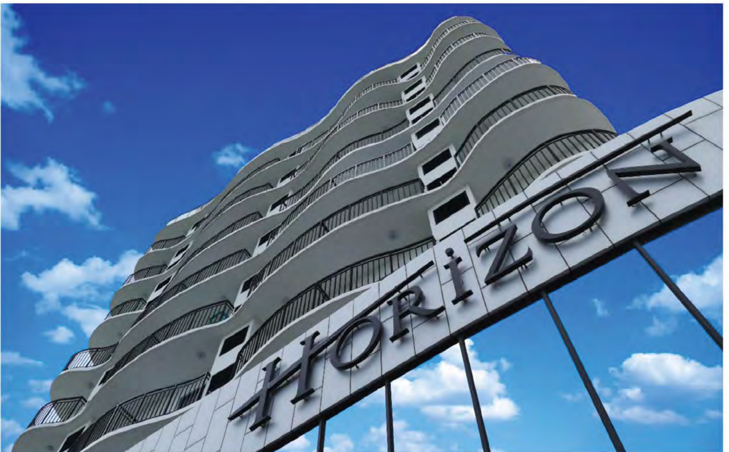
Horizon Tower One Condominium, Clark