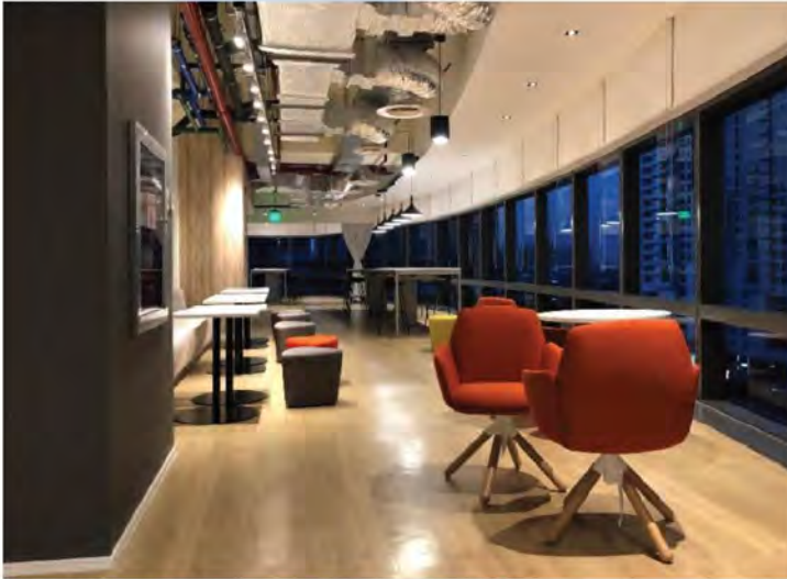
Novartis Office, Manila